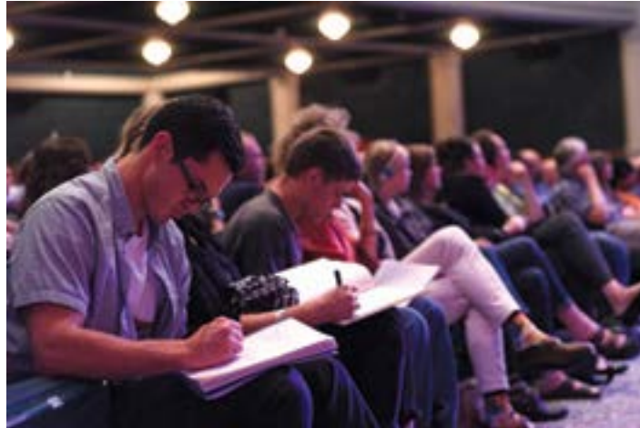
SLCC students take notes during Reich’s presentation.

The University of California Berkeley public policy professor did not disappoint, often mixing in humor and anecdotes from his decades of experience as one of the world’s leading thinkers about work and the economy. Reich served during three national administrations, including President Barack Obama’s economic transition advisory board. He has almost 1.4 million followers on Facebook, where he hosts podcasts and posts videos under the categories “Bob In Conversation,” “Tax Fact of the Day” and the popular “Office Hours.”