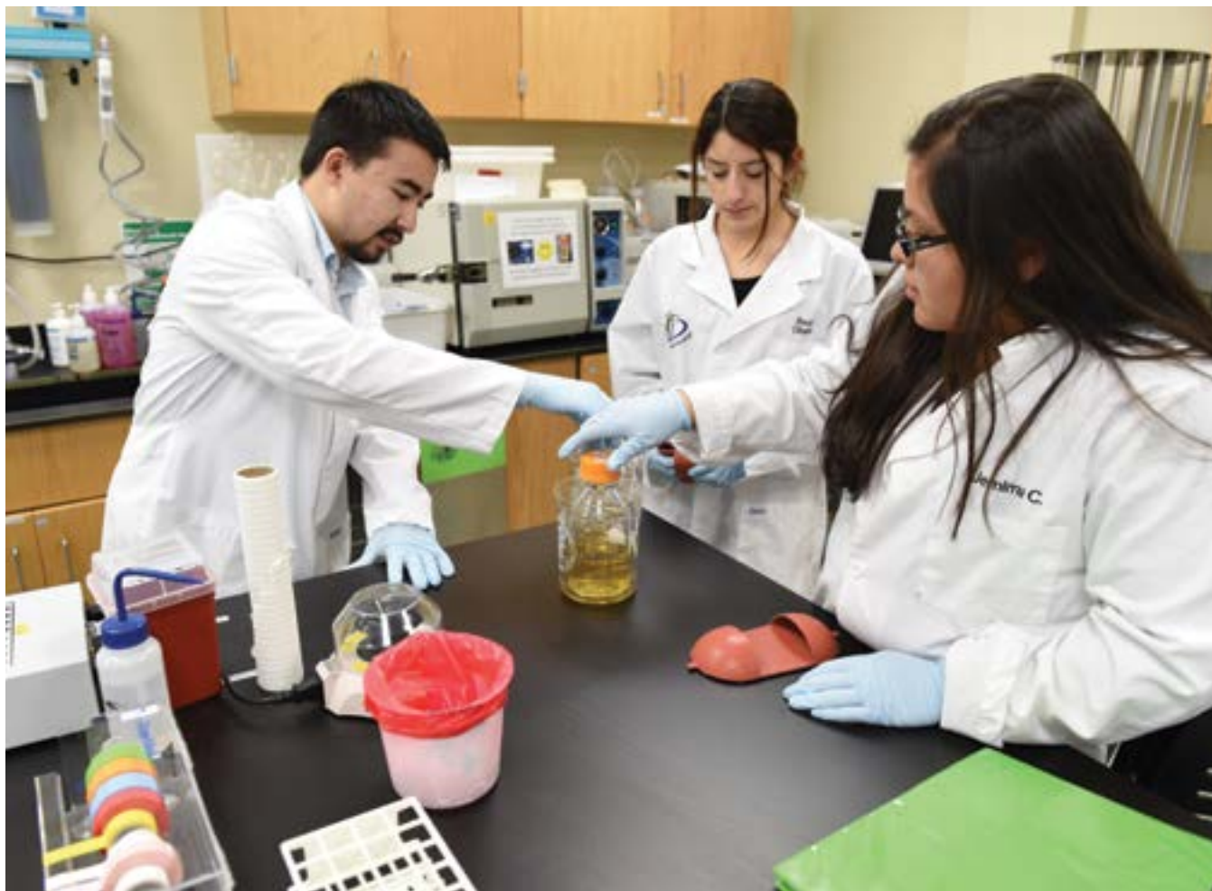
STUDENTfactorED students manufacture biotechnology supplies to sell to college and local high school instructors.

the CBE curriculum to meet workforce needs, to fill 200-500 new jobs in Utah within the next five to 10 years.