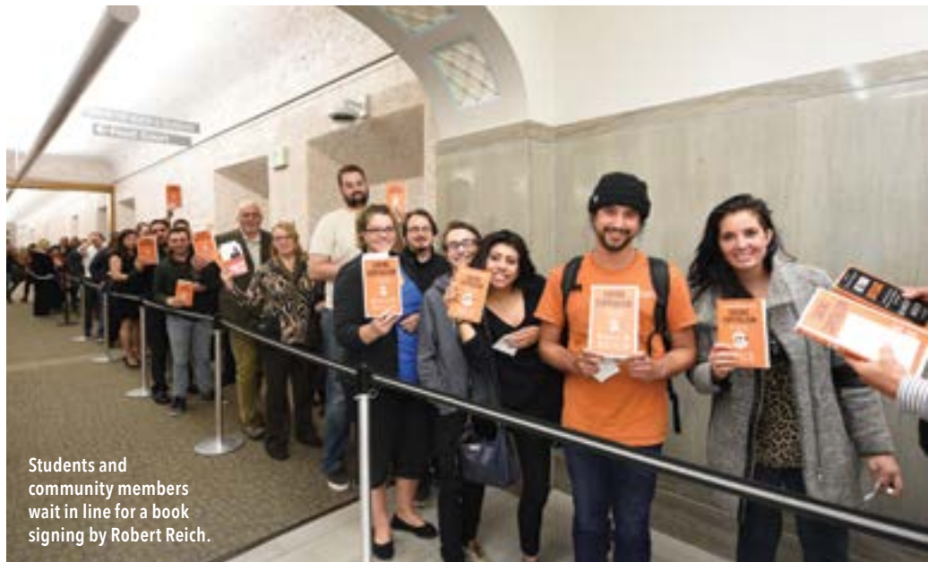
Students and community members wait in line for a book signing by Robert Reich.