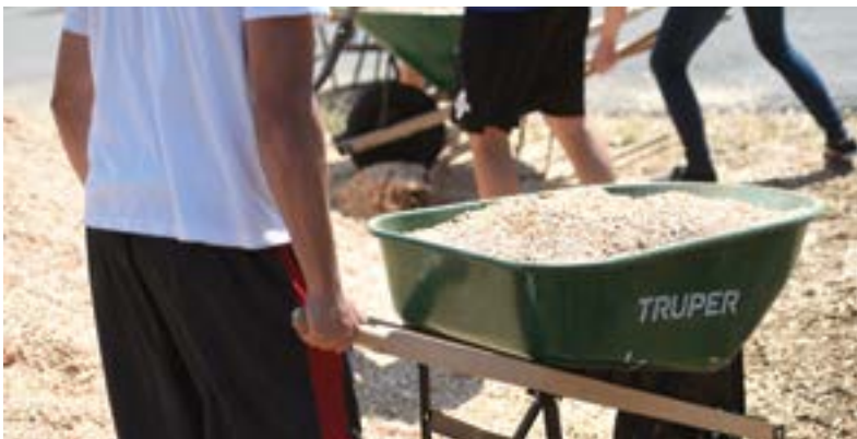
SLCC students at a volunteer project at Camp Kostopulos in Emigration Canyon.