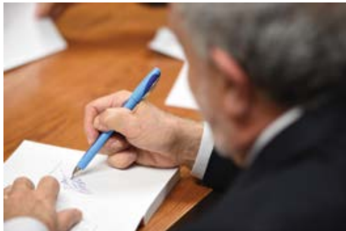
Reich signs books for students and community members.