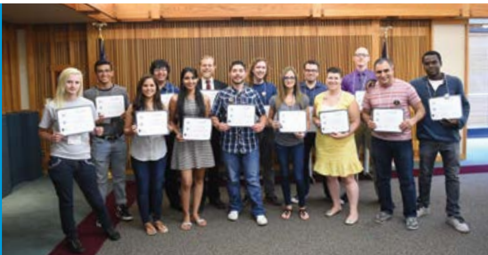
Students who received STEM awards in the first round of scholarships.