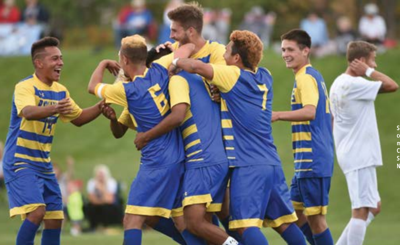
SLCC players celebrate in a match against College of Southern Nevada.