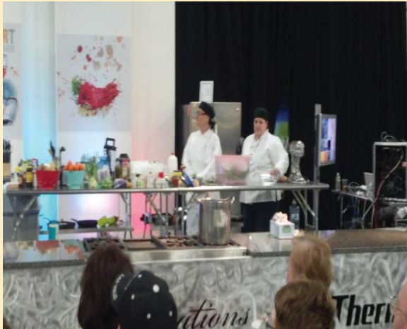
Contestants wait for judges' scores