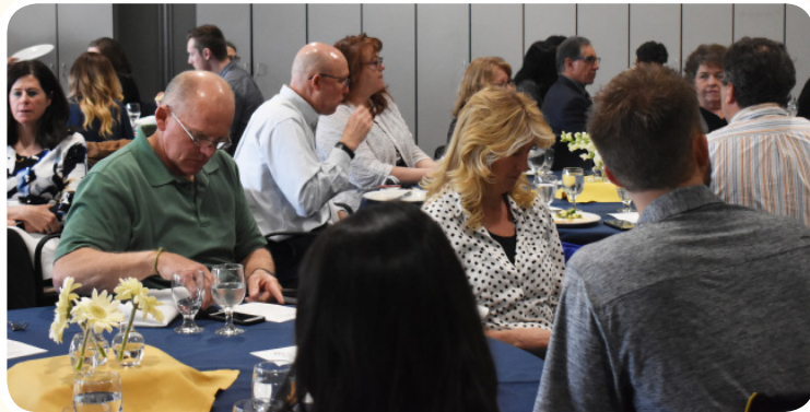
Reception Dinner for Recipients and family

Department faculty selected the recipients based on their success in the classroom as well as their embodiment of attributes critical to success in the future.