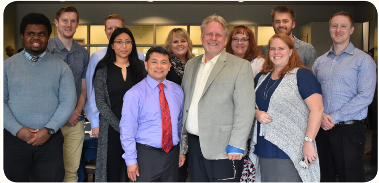
Outstanding Student Recipients with the Dean