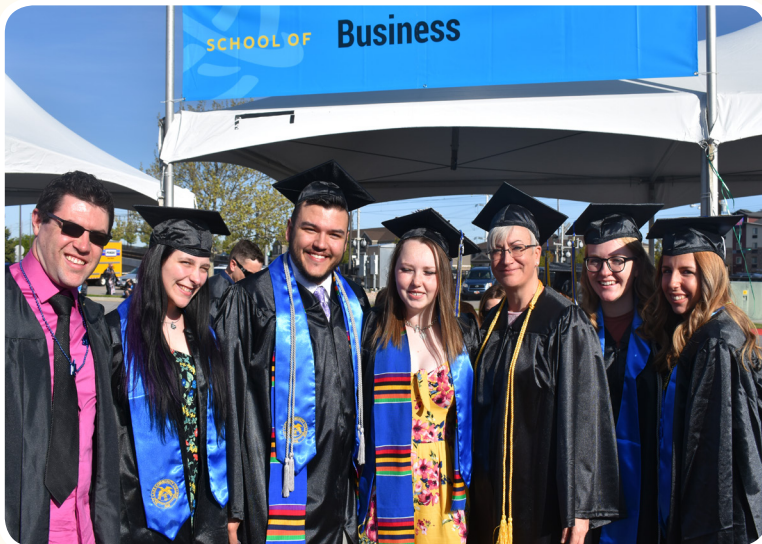
School of Business Culinary Students