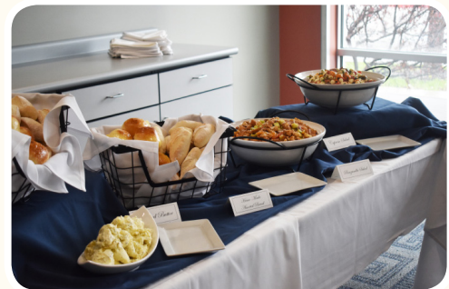
Food provided by our Culinary Students